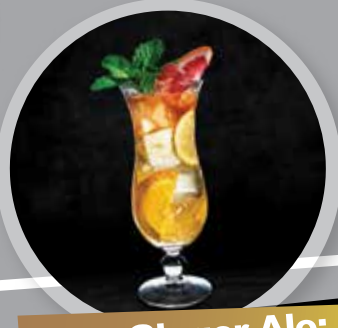
Dry Ginger Ale: Sweet Mocktail