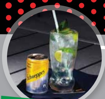
Lime & Tonic